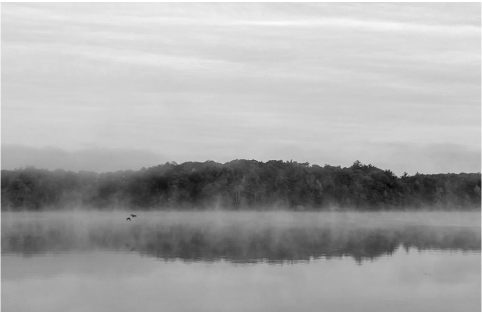
Gravelly Pond by Ben Patten